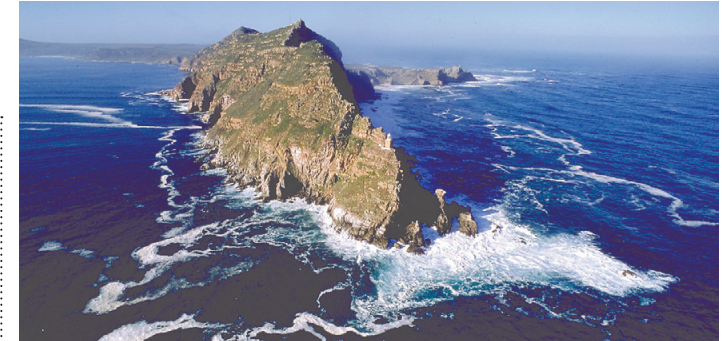
Cape Point on the Cape Peninsula

Partnerships between South Africa and Japan include the sourcing of scarce skills (electrical engineering, automotive industry and maritime, marine and aquaculture resources and biology) and securing technology transfers (clean coal, energy efficiency and water management). In this regard, cooperation with the Japan International Cooperation Agency (JICA) includes the African Business Education (ABE) Initiative that sees 83 South Africans currently completing their master's degrees and internships in highly technical fields in Japan, as well as a Technical Cooperation Project for Artisans being developed in close collaboration with the South African Department of Higher Education and Training. Following discussions on Universal Health Coverage (UHC) between the South African and Japanese health ministers, JICA is currently conducting training on health