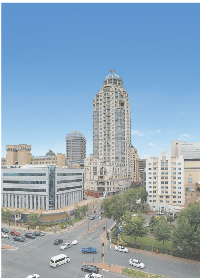
The Sandton area in Johannesburg

As we look forward to further enhance our relations with Japan while preparing for the 13th Partnership Forum to take place at the ministerial level between South Africa and Japan, as well as the South Africa-Japan University Forum this year, we call on our friends to join us in celebrating 25 years of freedom.